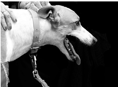
January Challenge---Jaci Hanson