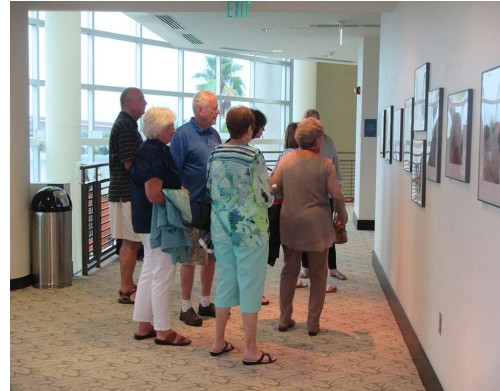
Enjoying the exhibit