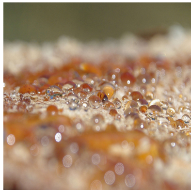
4 th - Debbie LeCrone