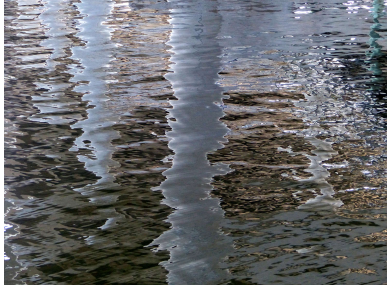
1 st - Bill Speno

expression. The assignment was also a contest that rewarded the winner with a free ($35.00 value) 2018 CCC membership. Congrats Bill Speno!!