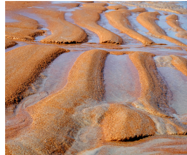
3 rd -David Pruett