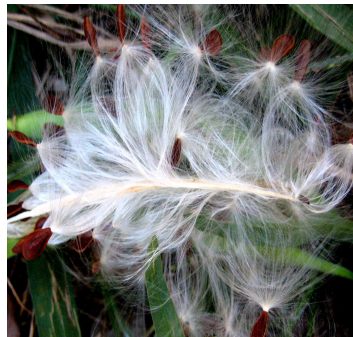
2 nd - Terry Dickerson