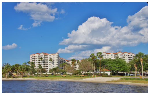
New Ormond Hotel—Debbie LeCrone