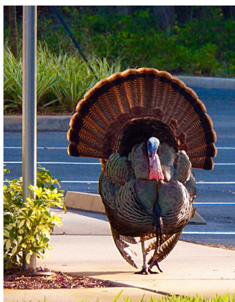
Turkey on street / Jaci Hanson