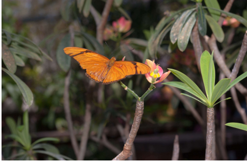
Yellow Butterfly-Carole Messina