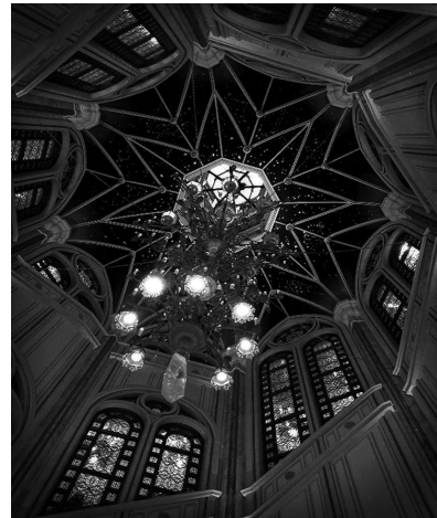
Casements Award-When you wish upon a star Angela Bean

Congrats to all and a special thanks to the hanging crew