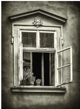
Best of Show—Forgotten Flowers Vicki Payne