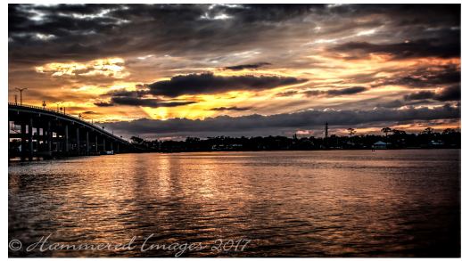
Sunset Granada Bridge..Bill Hammer