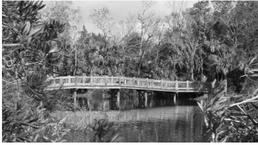
Central Park...Judy Schultz