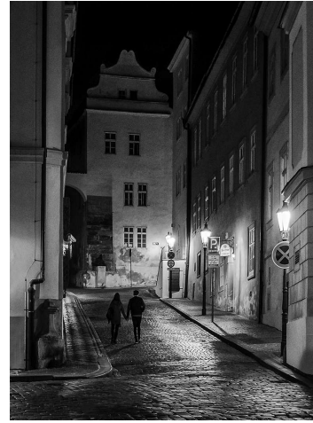
3 rd Place Evening Walk in Prague-Vicki Payne