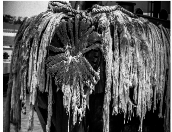
Lightroom --Digital positive