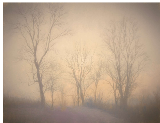
Tom Silvey---Morning Glow