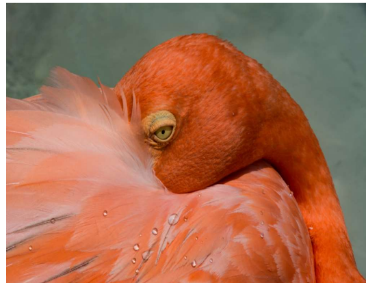
2 nd Place---Sandi Blackmer