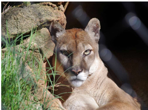
People's Choice---Debbie LeCrone