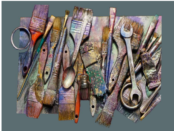
3 rd Place----Judy Speno