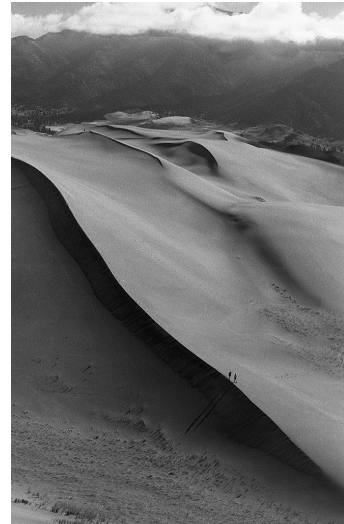
MA--- Skip Lowery