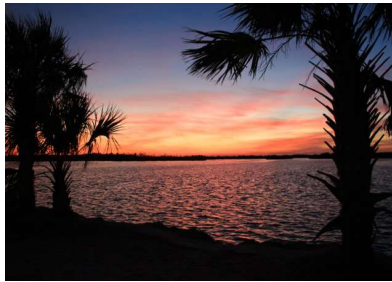
Judy Schutz Untitled