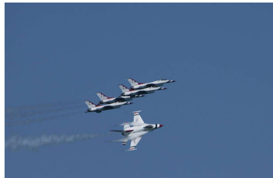
3rd-- Sylvia Camille---Wings & Waves