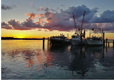
Sandi Blackmer Shrimp boats at dusk