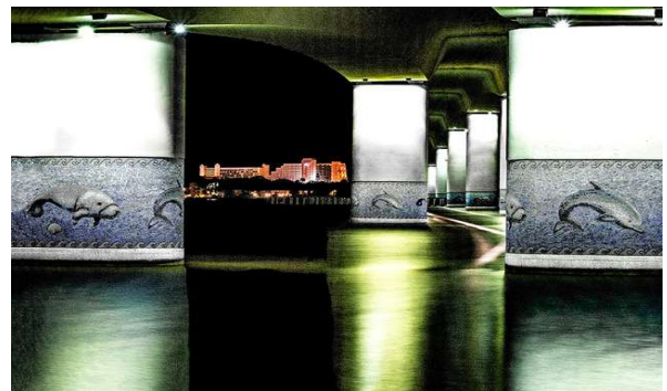
2 nd Place--Larry Parker