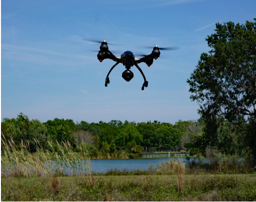
Drone in Central Park---Judy Speno