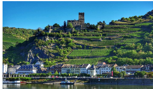
Casements Awards---Jeanne Figurelli