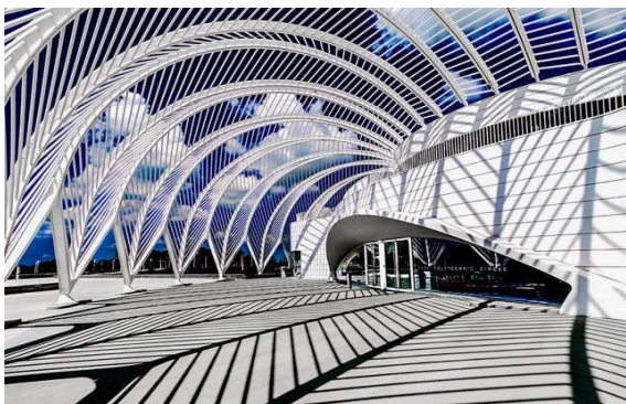
3 rd Place---Larry Parker