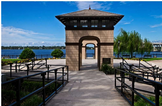
© Stan Mitchell (all rights reserved) - WB3

In the October 25 th meeting the board will present an introduction to the ON1 Photo Raw System. (My 2 cents-- I purchased this system in January and I really like it), so I am looking forward to this presentation. And no, I will not be giving it, so you can breathe better. LOL!!!! We will have 2 slideshow presentations which will feature the images from the September 11 field trip at the Casements and the September challenge, "Architecture." Hope to see y'all there!! Ans sent me these images for the newsletter. I am innocent, I knew nothing about mine!