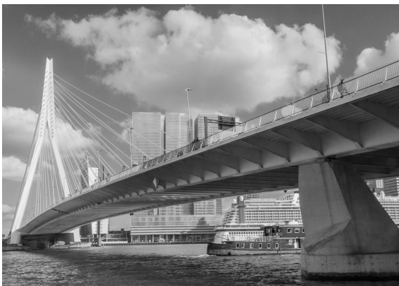
A Modern Port City ---Tom Silvey