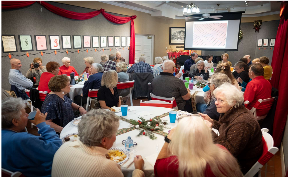
A full house @ the 2018 CCC Holiday Party!!!!!!