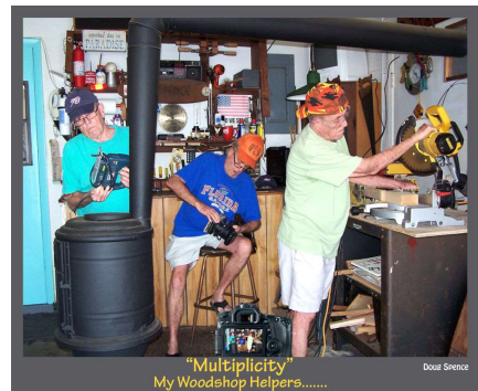
Humor in his workshop