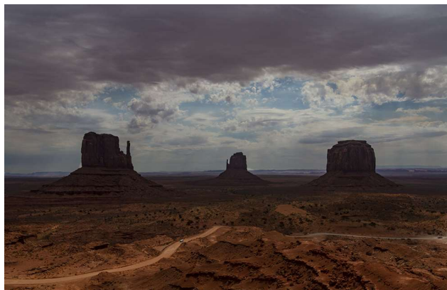
Monument Valley