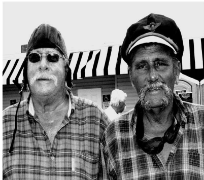
Old Time Bikers