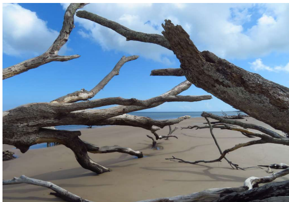
Big Talbot Island---Rick Seiler