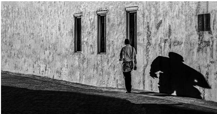
1 st Place---Larry Parker