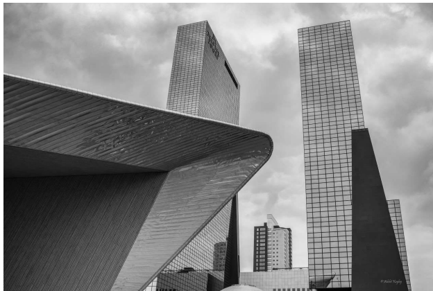
Best of Show---Adelet Kegley