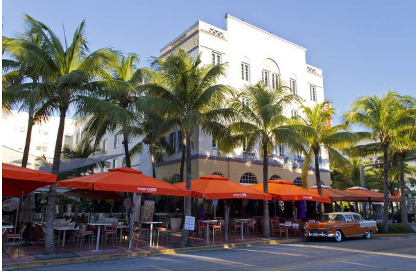
Miami South Beach----Ans van Beek