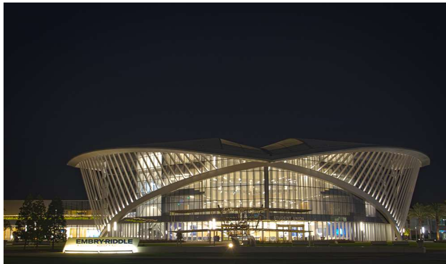
ERAU Night Shot--Ans