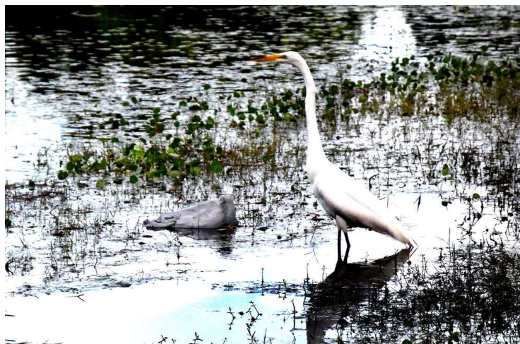
Skip Lowery---Dream Green Volusia

Congrats Skip!!!! I happen to agree with Skip as this would be a great photo challenge for the group and the means for the club to use its skills as a community service and public awareness. FOOD FOR THOUGHT!!!!!!