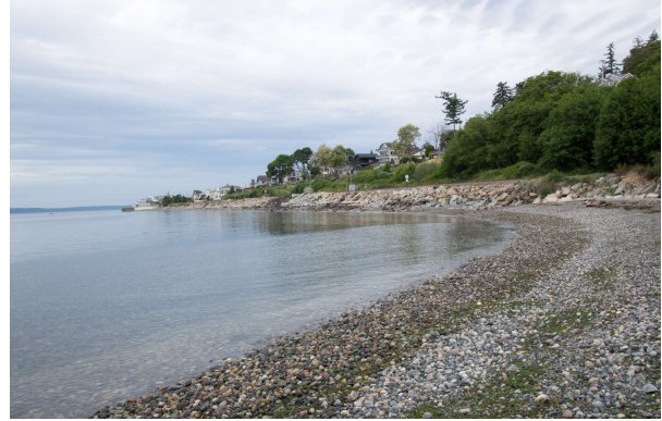
Richmond Beach curve---Lucie Lachance