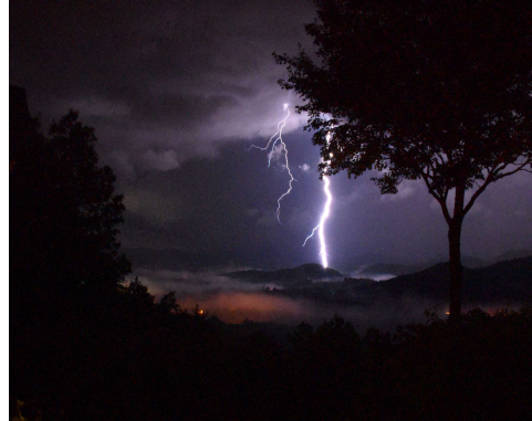
Lightning Storm-Skip Lowery