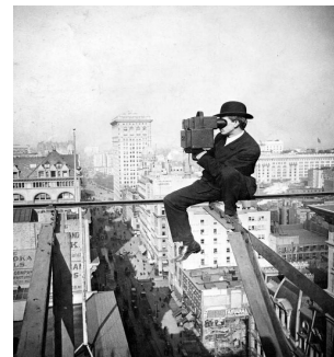
Famous New York Skyscraper photographs by Charles Ebbets