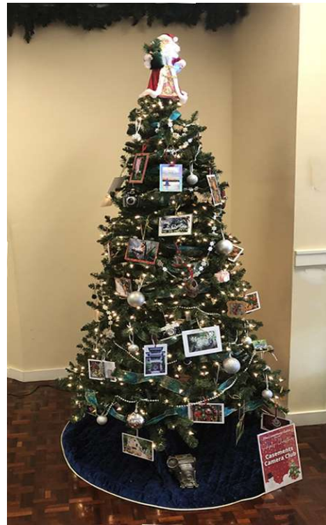
Casements Camera Club Christmas Tree 2020

As of December 5, the Casements is open to the public Monday thru Friday from 8:00am to 5:00pm and Saturdays from 8:00am to 12:00pm. This would be a great opportunity to view the club's Christmas tree.