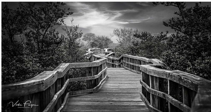
Best of Show —Vicki Payne