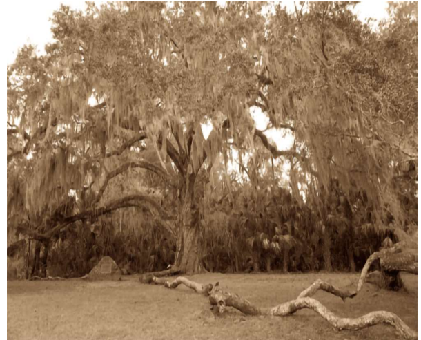
2 nd Place —Michele Sweeters