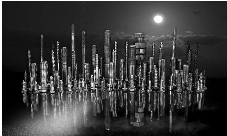
1 st Place —Stan Mitchell