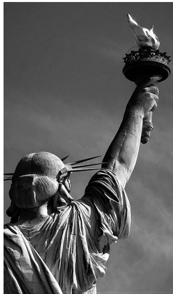
HM & CASEMENTS AWARD-Ron Zeier