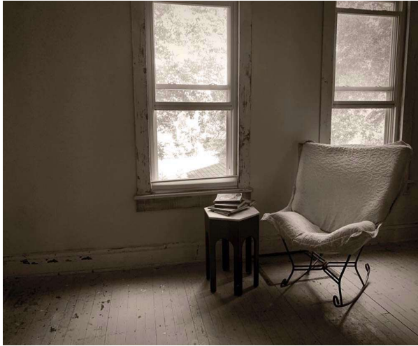
3 rd Place —Kathleen Pruett