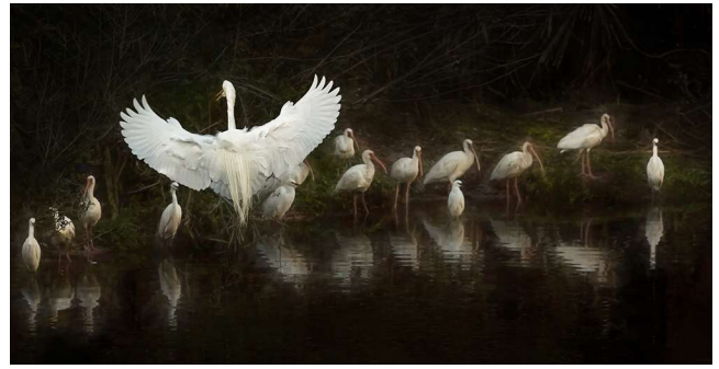
Best of Show--Vicki Payne