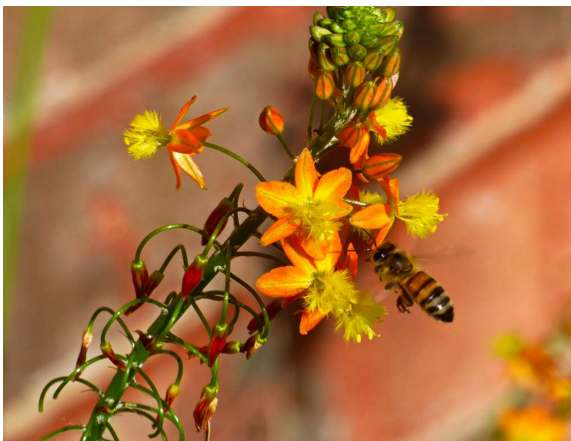
3 rd Place—Donna Lovelace--Flora