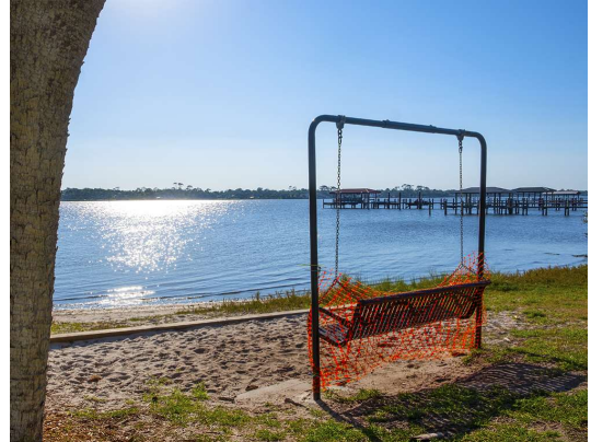
No seats available—Sylvia Rohmer