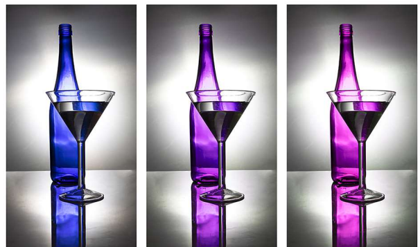
2 nd —Place--Ans van Beek