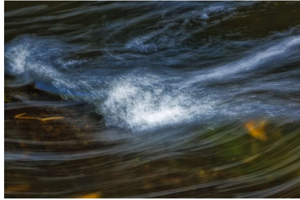
Go with the Flow—Ronn Orenstein