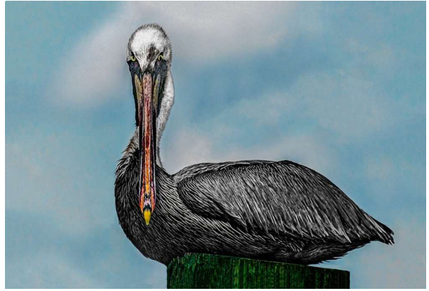
2 nd Place—Larry Parker