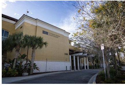
The Southeast Museum of Photography—submitted by Ans van Beek