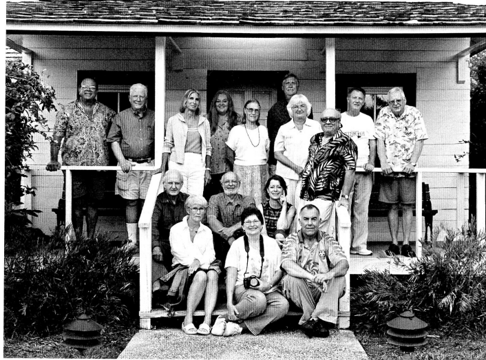
Members Way Back When