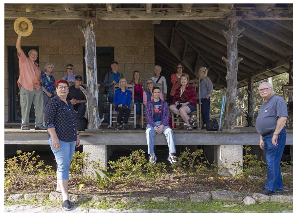
The workshop group