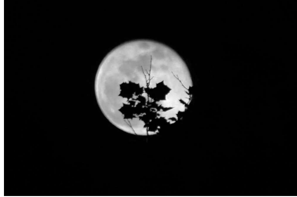
HM-- Debbie LeCrone