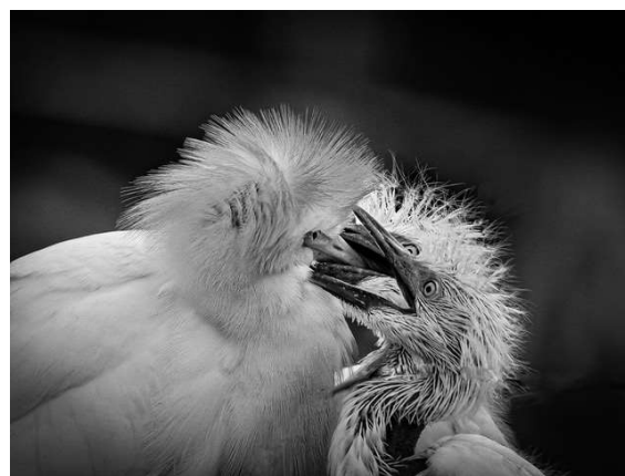
3 rd Place—Bob Currul