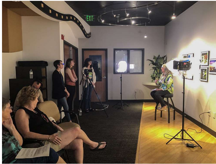
Video session at the Southeast Museum of Photography

channel has been launched and an official announcement will be sent to the club.